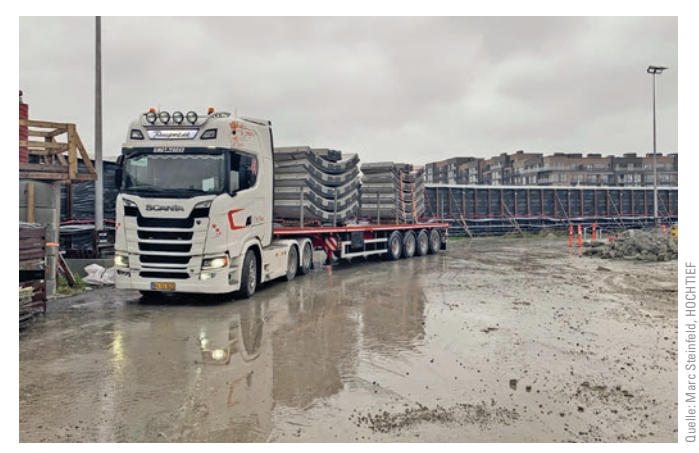
Bild 4 Transport von zwei Ringen zur Baustelle Transport of two rings to the construction site

The tunnel lining segments are manufactured in Germany and then transported to an interim storage facility in Denmark by rail. From this interim storage facility, the segments are transported to the construction site in pairs of two rings per lorry (Image 4). This has already proved to be a problem-free and economical solution during the construction of the Nordhavnen line. A total of about 5,700 rings are produced for the Sydhavnen tunnel, which is equivalent to 34,200 individual tunnel lining segments. Since the segments were transported to Denmark by train, more than 6 million kilometres of road travel were saved. Despite the logistic challenge and partly simultaneous operation of the tunnel boring machines, there were no delays in the construction process caused by any problem in the supply chain.