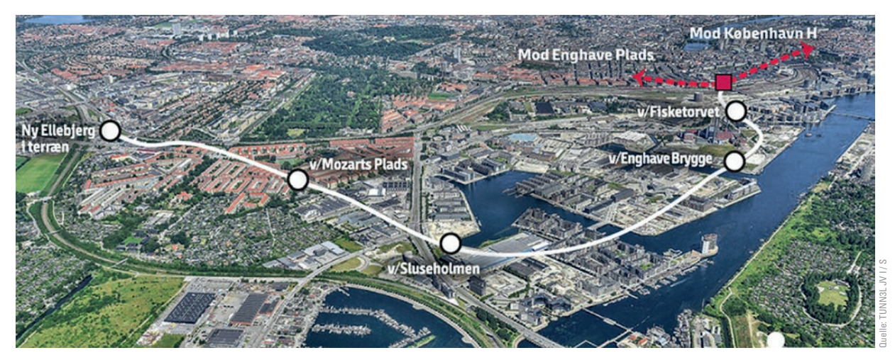
Bild 1 Verlauf der U-Bahn-Linie und Lage der Stationen Course of the line and location of the stations