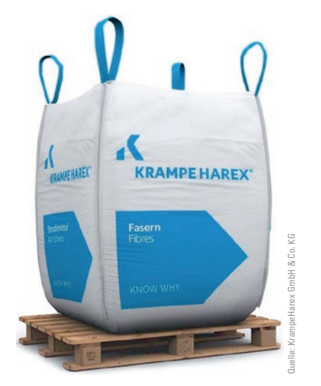
Bild 3 Big bag mit 500 kg Stahlfasern zum einfachen Nachfüllen der Dosiereinheit Big bag with 500 kg steel fibres for easy refill of dosing unit

Compared to conventional reinforcement (only steel bars), the use of steel fibres in prefabricated segments of-